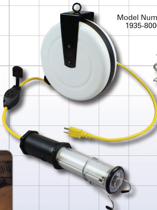
Model Number 1935-8006