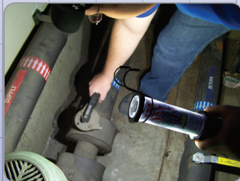
Bright Work Light