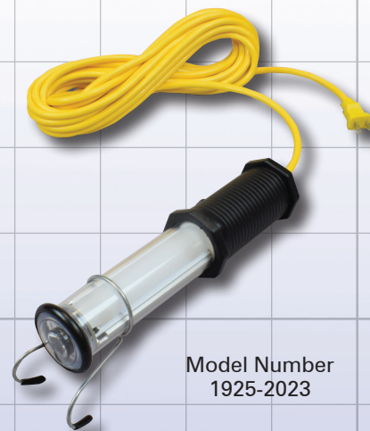
Model Number 1925-2023